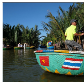
CAM THANH VILLAGE