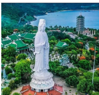
SON TRA PENINSULA